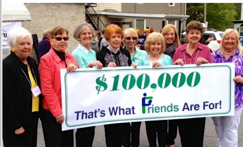
AAL's awarding winning Friends of the Adamstown Area Library donate $100,000 to kick off the AAL's Room to Grow Capital Campaign.