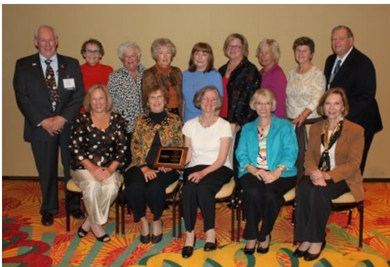
Friends of the Adamstown Area Library posing for the BEST FRIENDS GROUP OF THE YEAR AWARD in PA!